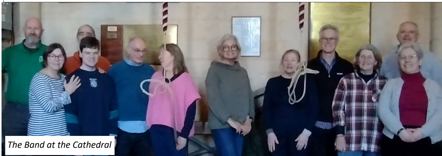
The Band at the Cathedral